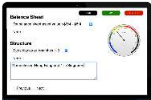
DROP + CLICK + CALCULATE

Log in to your Dashboard, enter a Unique business ID, provide an email address to send results, enter data inputs from a drop down list, add discretionary file notes then click 'Calculate'.