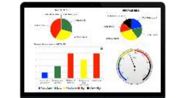
HEAT MAPS + DATA REPORT

Log in to your Dashboard, enter a Unique business ID, provide an email address to send results, enter data inputs from a drop down list, add discretionary file notes then click 'Calculate'.